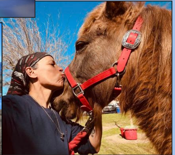
Bates Nut Farm 02-04-2023

Escondido 68° Sunny H:69° L:46° Sunny conditions will continue for the rest of the day. Wind gusts are up to 8 mph.