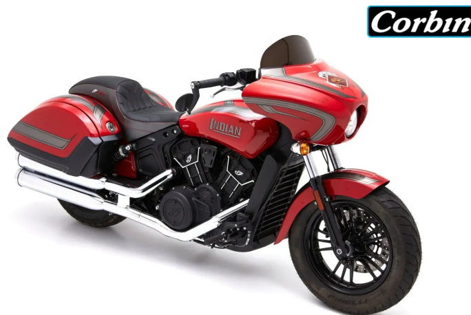
Custom Indian Motorcycle Sponsored by Corbin